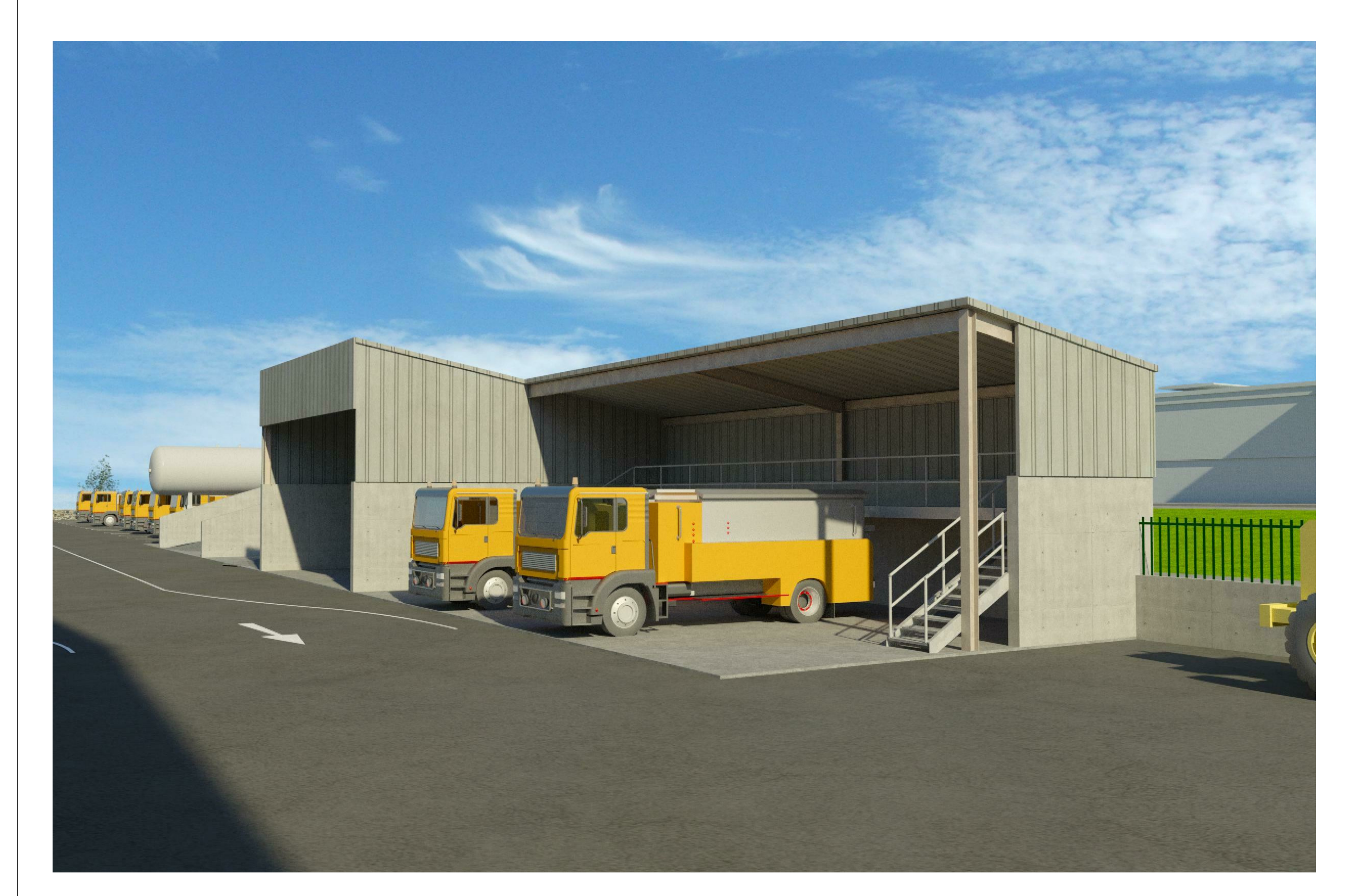
TRUCK WASH VIEWED FROM EASTERN END OF SALT BARN