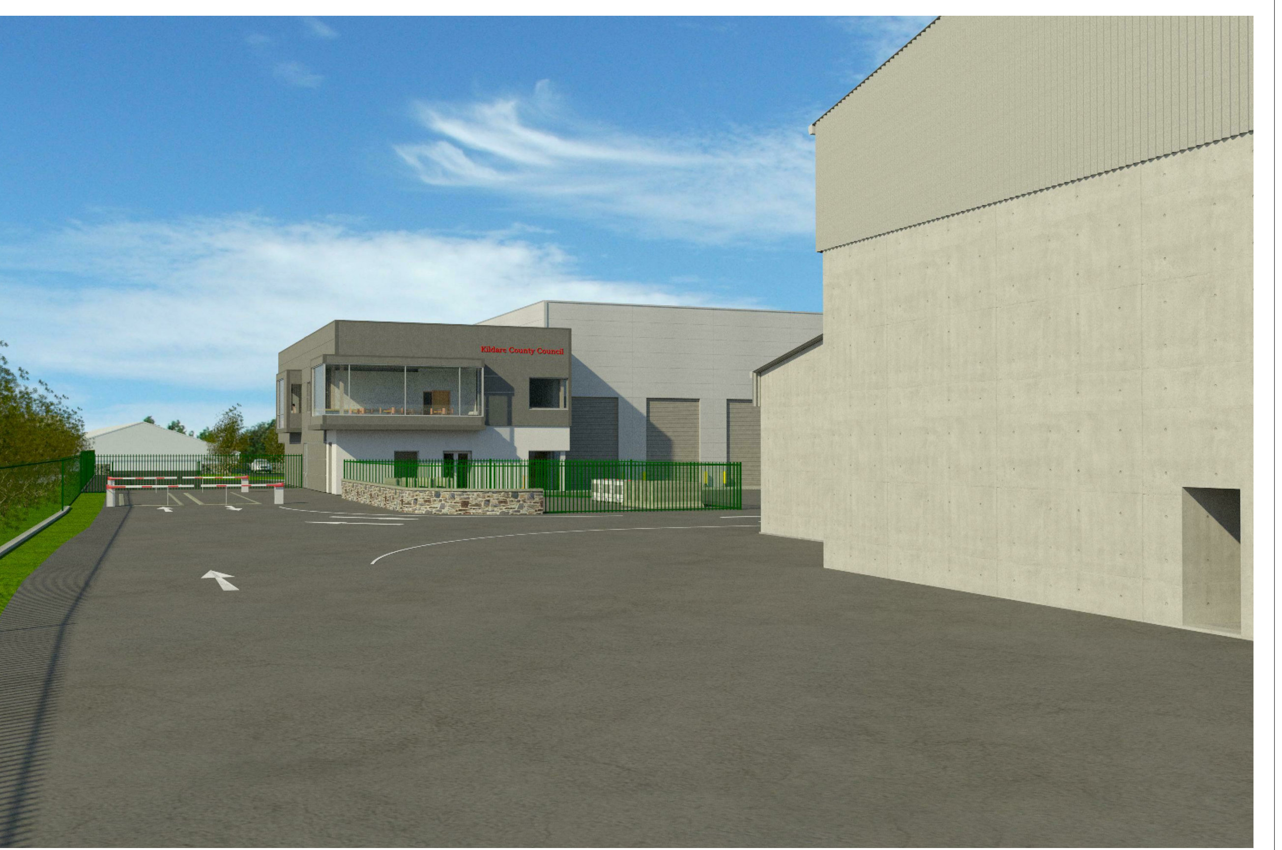
ADMIN VIEWED FROM WESTERN BOUNDARY ADJACENT SALT BARN