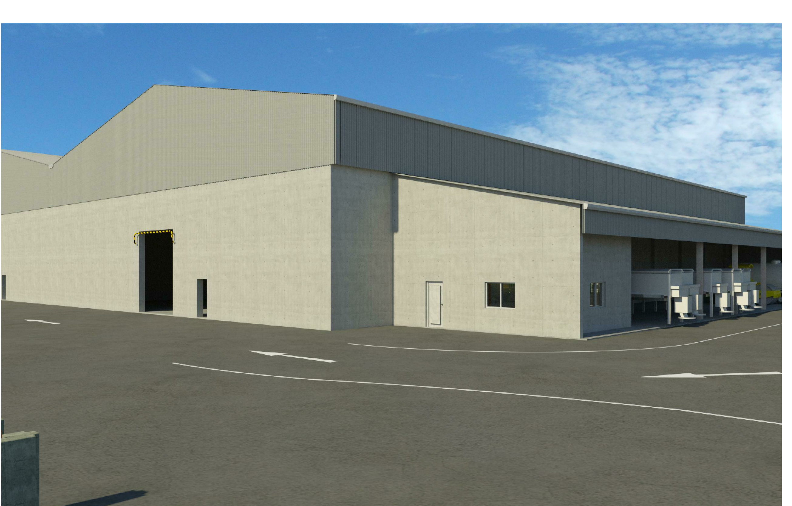
SALT BARN VIEWED FROM CHIP STORE AREA