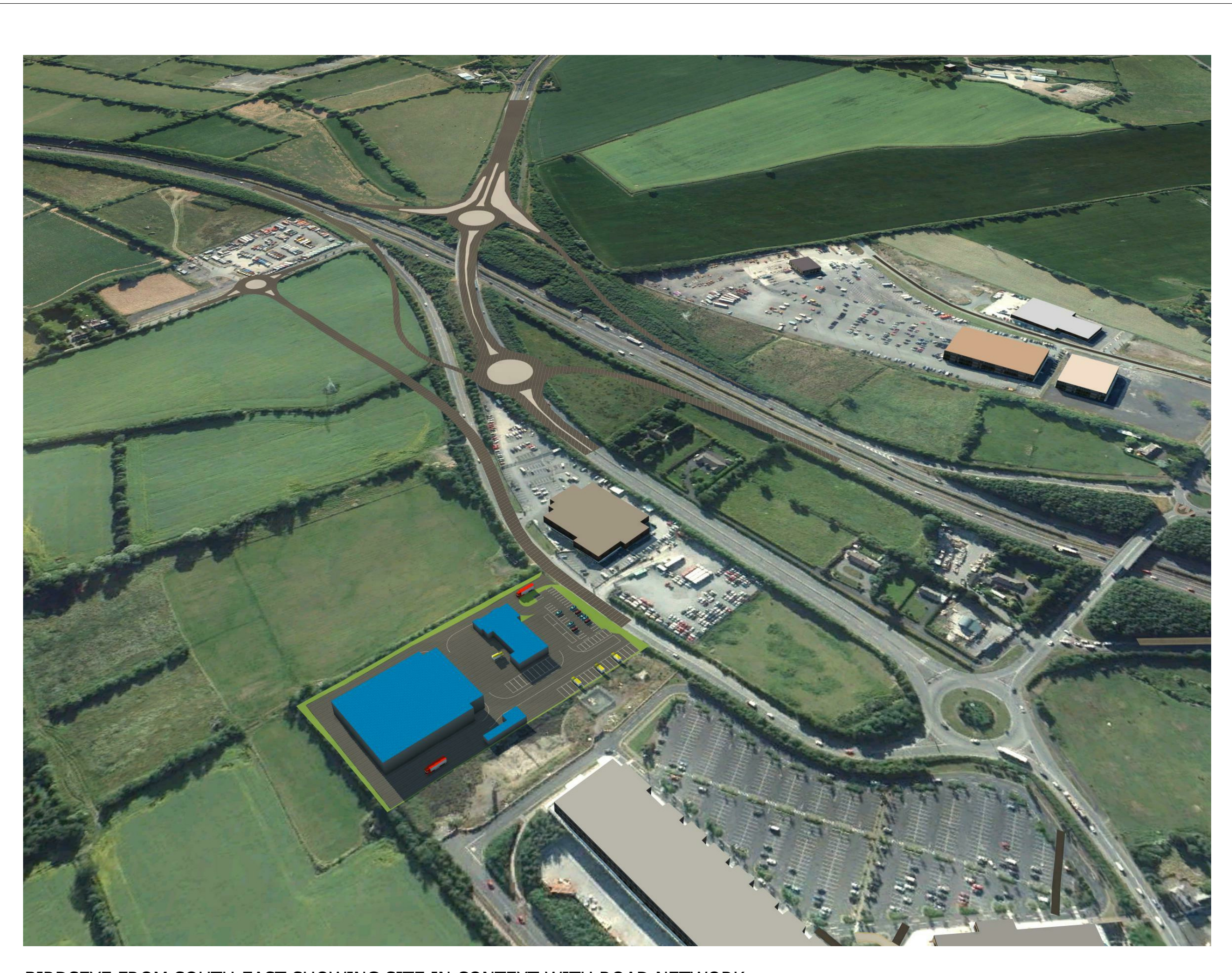
BIRDSEYE FROM SOUTH-EAST SHOWING SITE IN CONTEXT WITH ROAD NETWORK. PROPOSED BUILDINGS INDICATIVELY SHOWN HATCHED BLUE